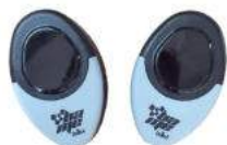
12/24V SAFETY PHOTOCELLS