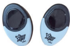
12/24V SAFETY PHOTOCELLS